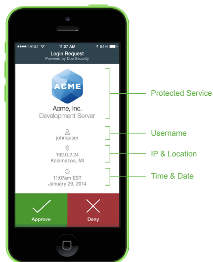
Figure 1: Custom-Branded Push Notification Example

Organizations that require a higher level of protection for compliance with regulations such as PCI-DSS or HIPAA, for example, or that want to enhance the multiple authentication methods offered by Array's AG Series secure access gateways, can utilize Duo Security's integration to add Duo two-factor authentication as an additional layer of security.